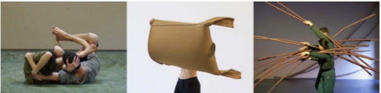
Double Portrait | Turning Solo 2 | Harvest

A joint event with the Werkhalle Wiesenburg